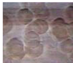
This is a picture of blood cells in an individual after using an Ion detoxification system.

When the Ion Spa is set, the positive ions are being produced in the water, which raises the users PH to a more alkaline state. Why is this significant? The vast majority of people in North America live in an acidic state—their bodies contain an excess of hydrogen ions and their