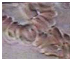
This is a picture of blood cells in an individual before using an Ion detoxification system.

An ion is a charged atom that has gained or lost an electron, thus creating a magnetic field capable of neutralizing oppositely-charged particles (toxins in the human body). The Ion Spa's control head delivers an electrical current through the ionizer® array to generate positively charged ions. These ions travel through the body and attach themselves to toxic substances, thereby neutralizing these toxins' negative charges. After being neutralized, toxin particles are pulled through the skin and out of the body via osmosis, attracted by the highly concentrated ion field in the Ion Spa water.